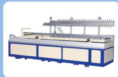
FORMING & COOLING TANK