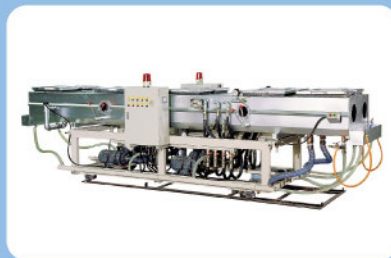
VACUUM & COOLING TANK VACUUM SPRAY COOLING TANK WITH WATER-CIRCULATING